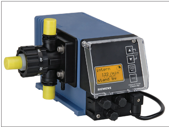
Chem-Ad Series A