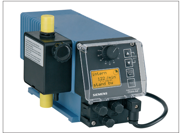
Chem-Ad Series B