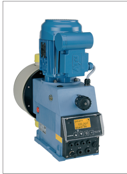
Chem-Ad Series D