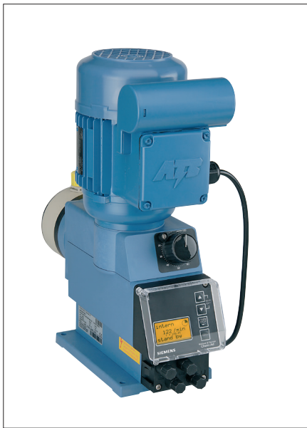
Chem-Ad Series C